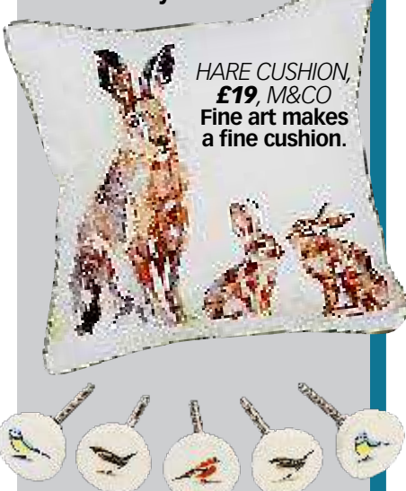
BIRD DRAWER HANDLES, £3 FOR FIVE, SAINSBURY' Perfect for twitchers