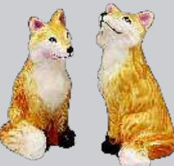
FOX SALT & PEPPER SHAKERS, £16, CATH KIDSTON Annoying in the garden but sweet on the table.