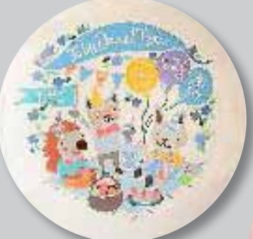
PERSONALISED WOODLAND PICNIC DECORATIVE PLATE, £35 , ETHEL AND CO@JOHN LEWIS Perfect baby gift, personalised with the birth details.